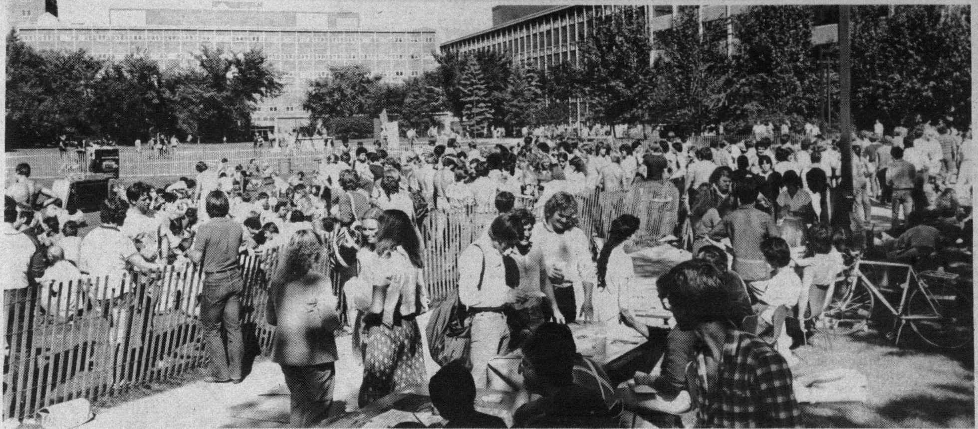
Thousands came out to enjoy the Festivities in Quad all week.