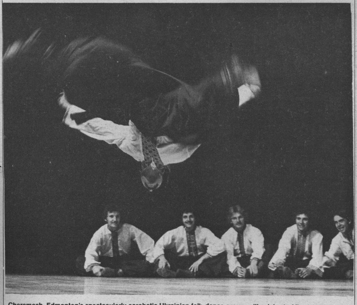
Cheremosh, Edmonton's spectacularly acrobatic Ukrainian folk dance group, will celebrate Alberta's 75th anniversary Saturday and Sunday in the Jubilee Auditorium.