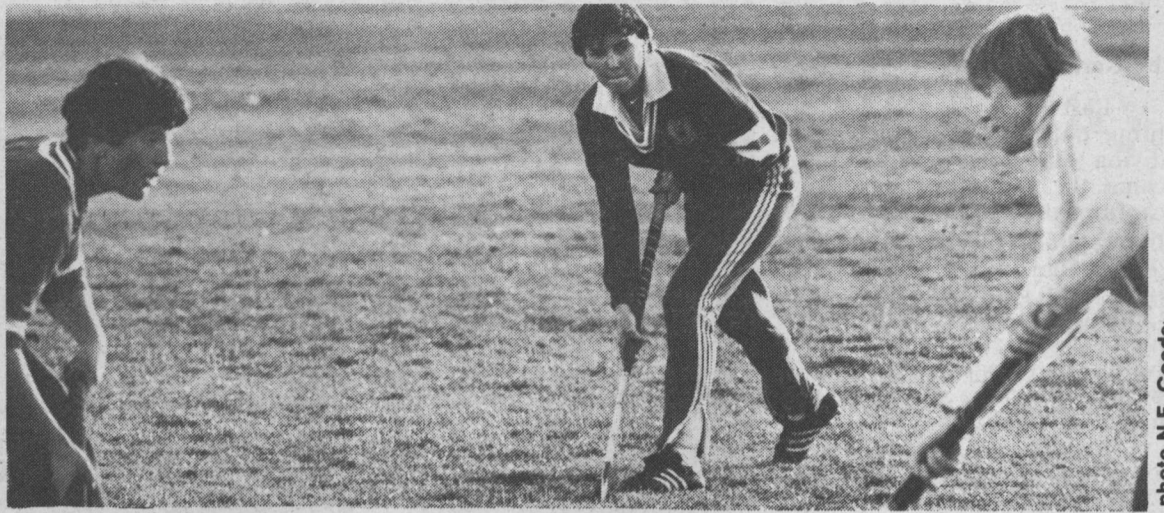
Pandas have had a good season in spite of losses at CIAU finals.