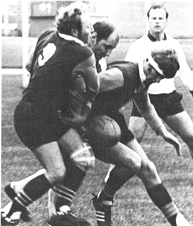
OH NO YOU DON'T ... that's our ball