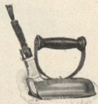
3-pound Flat Iron for Sewing Room or Nursery

The heating and cooking appliances designed and manufactured by the Canadian General Electric Company mark a new epoch in domestic science in that they employ electricity to generate heat with absolute reliability and (when properly used) with excellent economy. They are SAFE even in the hands of the unskillful, and are practically INDESTRUCTIBLE.