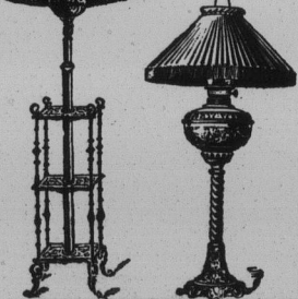
Table and Floor Lamps

C. FLOOD & SONS, ST. JOHN, Keep in stock the largest variety of fine quality