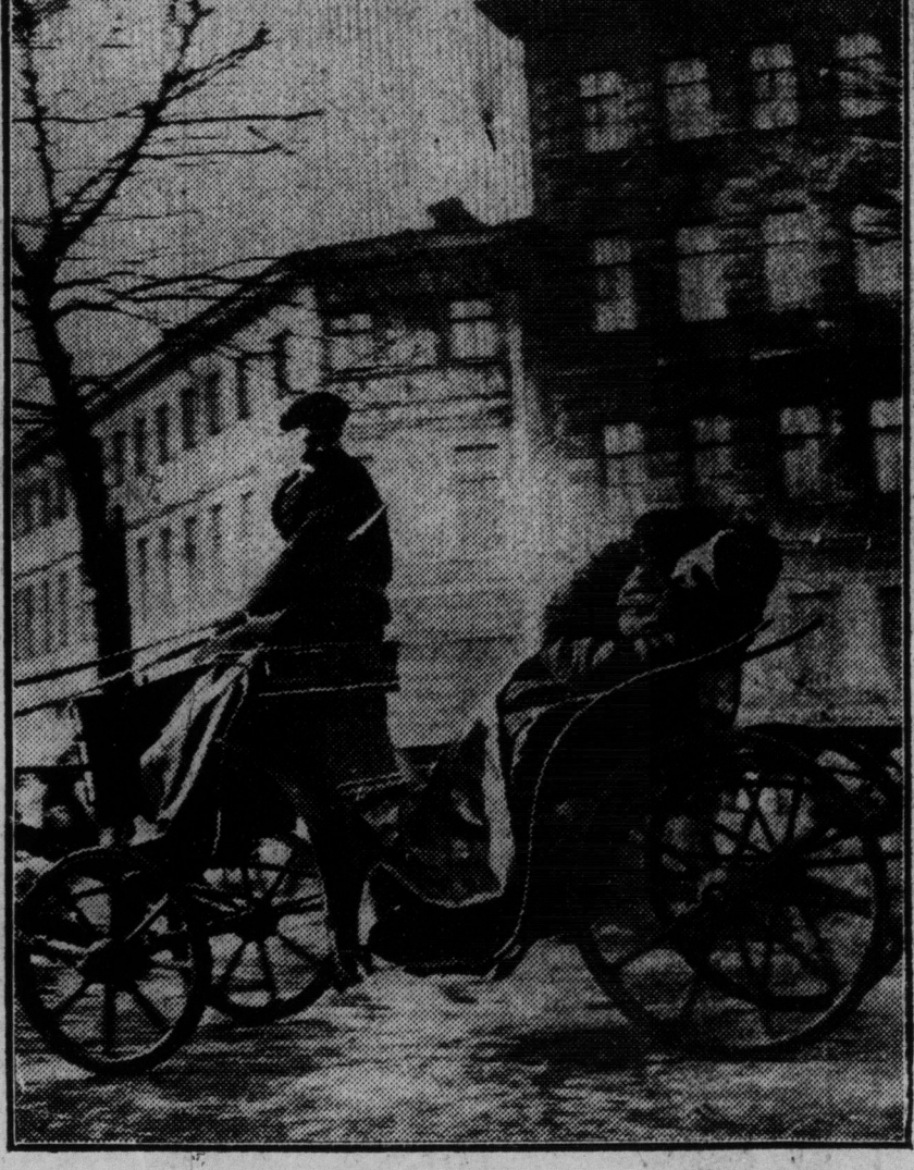
The manager of the Russian Bolshevik state bank in Petrograd on his way to business, still suffering from the effects of a night of roystering. The

The crowds were kept cheerful by the sight of great bills on the