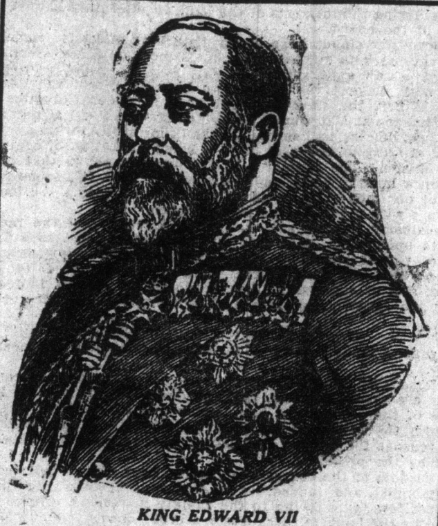
KING EDWARD VII

The equipment includes steam boiler, condensing tank, feed pump, injector, steam engine, cold and hot water tanks, soda cleaning medium, washing machine, draining box, centrifugal driers, mangle, fan, ventilator and disinfectant, together with ironing board, with heaters at the finishing end, the central portion being used for drying and storing the linen. Thus, a complete laundry on wheels is provided, which should do much towards improving sanitary conditions in the army.