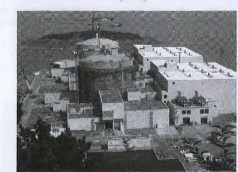
A view of Qinshan III Unit 2 and Unit 1 (background)

the Department of Foreign Affairs and International Trade and Natural Resources Canada were at the forefront of the "Team Canada" marketing effort led by the Prime Minister going back to 1994.