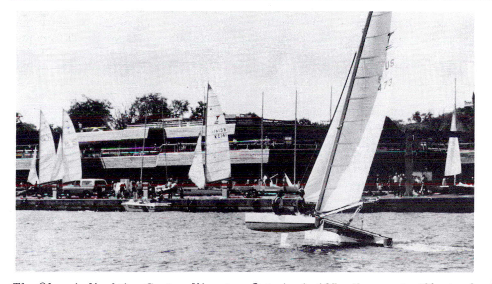
The Olympic Yachting Centre, Kingston, Ontario, is 185 miles west of Montreal.

The year 1975 was also notable for the Snowbirds; returning to the "Land of the Midnight Sun", the team, on May 11 performed a full display at midnight, at Inuvik. Throughout 1975 the team flew 74 shows at communities both large and small across Canada as well as at other major locations in the United States.