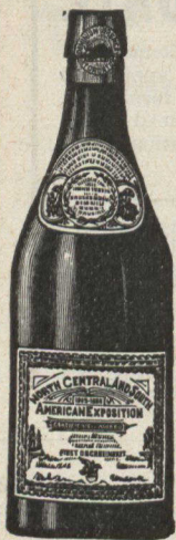
FAC-SIMILE OF WHITE LABEL ALE