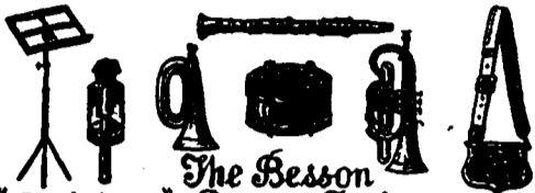
The Besson Prototype Band Instruments 42 Medals of Honor.

The Prototype Instruments, being unequalled in musical quality and durability, are the best and cheapest for use abroad.