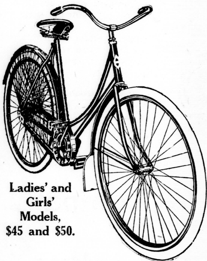
Ladies' and Girls' Models, $45 and $50.

Is not an expense. It's an investment in every sense of the word and pays big dividends.