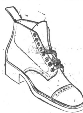
MEN'S BLACK LAC- ED BOOTS with rubber heels. Only $4.00.