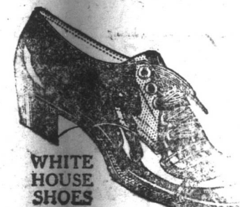
WHITE HOUSE SHOES MEN'S DARK TAN SHOES with rubber heels. for $5.50 & $6.50 per pair