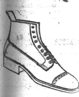
MEN'S DARK TAN BOOTS with rubber heels. for $5.50 and $6.50.