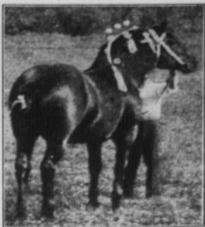
"Kolombin," 5186. Our Champion Percheron Stallion at Brandon, Regina, Saskatoon, North Battleford and Prince Albert Summer Fairs, 1916. This Horse weighed 2,310 lbs.

To the Farmers of the Canadian North-West we wish the