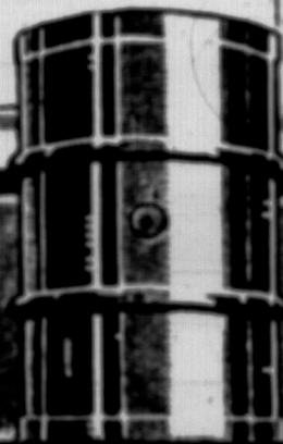
Plant is 27 inches long 14 inches wide 21 inches high