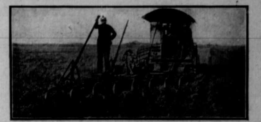
60 H.P. doing 25 acres a day—its regular allotment on a Kansas Farm Note clean-cut work and straight furrow slice