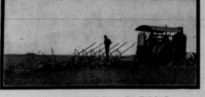
A Standard Breaking Outfit-Six Bottoms-Disc-Plank Leveller

One of our four sizes—30-40-60-80 h.p., will surely fit your farm.