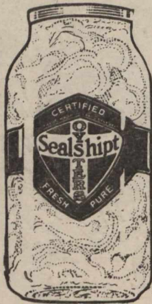
"Sealshipt Oysters" In Glass Jars