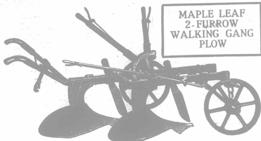
MAPLE LEAF 2-FURROW WALKING GANG PLOW

BY actual tests, in competition, this 2-furrow walking gang plow plowed two furrows 9 inches wide and six inches deep with but 25% heavier draft than a single-furrow walking plow, in the same soil and with the same horses and plowman. And it was heavy soil at that. To YOU this means that three horses and one man, with this plow, will do as much as four horses and two men with two one-share walking plows—and the plowing will be BETTER done, because only every other furrow is trod by the off-horse. That makes for easier harrowing and better tilth. On light soils TWO horses can do the work—the draft is so light.