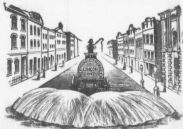
Studebaker Sprinkler (PATENT IMPROVED.)

Because no sweeper so effectually does the work for which it is designed as "The Studebaker," it Sweeps Clean. No sweeper is constructed with the same degree of care and mechanical precision. It Wears Well. "The Studebaker" has the smallest number of working parts, and has less gearing than any other sweeper made. It is free from all unnecessary complications. With reasonable care it does not get out of order. Send for complete descriptive catalogue.