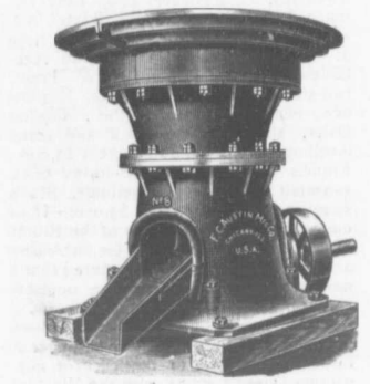
AUSTIN GYRATORY CRUSHER