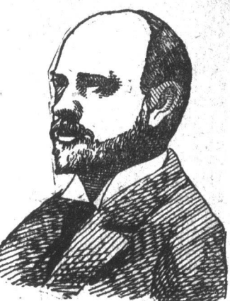
PROF. W. H. PICKERING.

An astronomical article published but a short time ago made this statement: "Saturn has at least eight satellites. A ninth was discovered photographically in 1890 at the Arequipa (Peru) station of the Harvard University observatory, but this discovery still lacks confirmation." However, Professor William H. Pickering, who originally made the find, has now proved beyond cavil the existence of the ninth satellite. Saturn, the ancient divinity of the Greeks and Romans, had numerous relatives, and as fast as astronomers have discovered new satellites of the planet Saturn they have named them