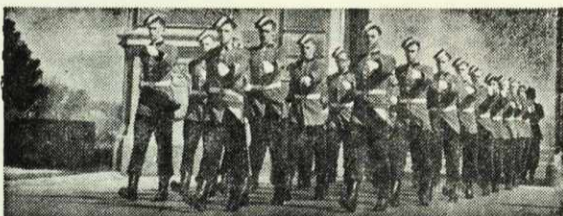
THE REGULAR OFFICER TRAINING PLAN —This is a tri-Service Plan wherein high school graduates receive advanced education and leadership training at one of the Canadian Service Colleges or a university to become officers in the Royal Canadian Navy, the Canadian Army or the Royal Canadian Air Force.