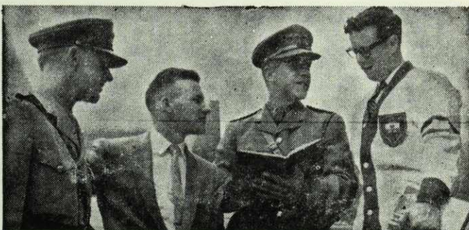
THE CANADIAN OFFICERS' TRAINING CORPS —University undergraduates may obtain a commission by training during their spare time and summer holidays. The student who trains under this plan is paid for his actual training time and is not obligated for full-time service after graduation.