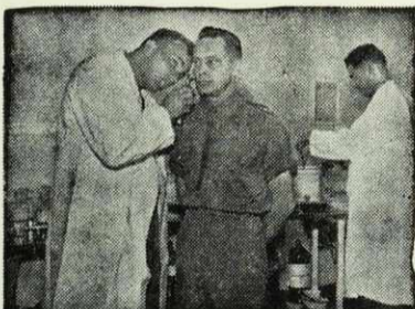
SUBSIDIZATION FOR PROFESSIONAL TRAINING —There are tri-Service plans wherein university students in medicine or dentistry can be subsidized during their course and become commissioned Doctors or Dentists in the Canadian Armed Forces.

Here are four interesting and rewarding plans for young men interested in a career as a commissioned officer in the Canadian Army: