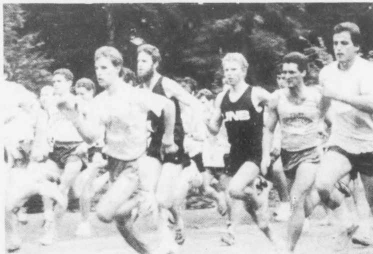
UNB runners hope to be first across the line tomorrow

"I'm not surprised by how our regular season went. We had a large number of returning runners. The rookies on the team have helped because they've pushed the veterans in the