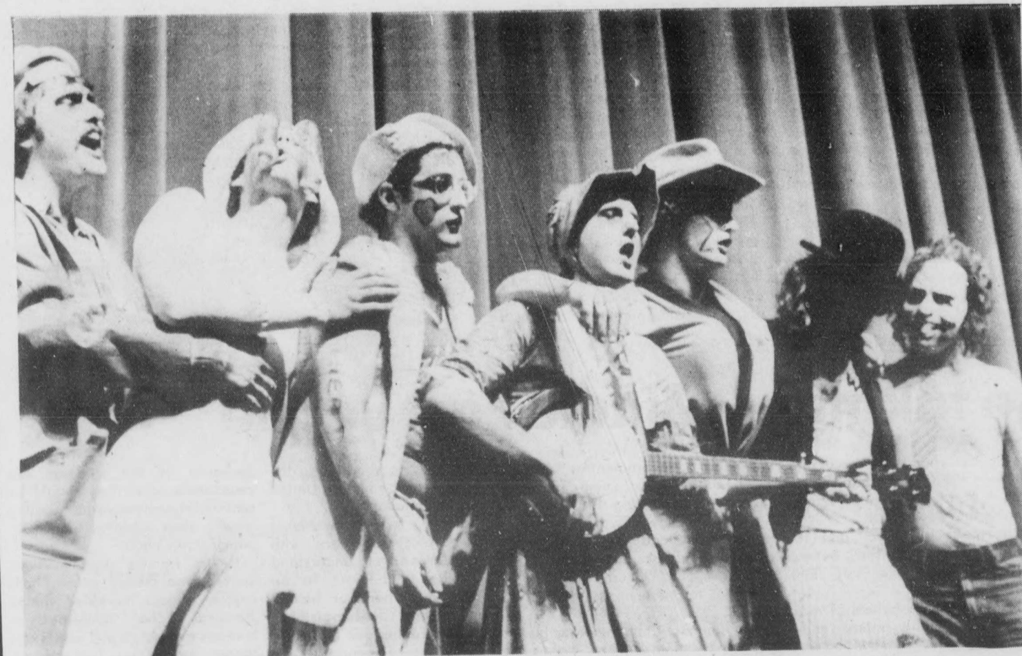
ANNE KILFOIL Photo