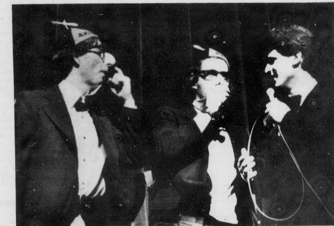
ANNE KILFOIL Photo