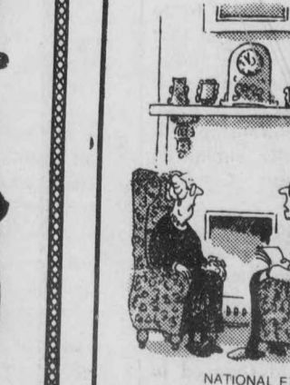
NATIONAL EXAMINER and if I go first, Clara, all I ask is a reasonable start...

Please note: if hallucinations and involuntary bodily reactions occur, do not worry, it's all a part of the wonderful Easyfast reducing plan.