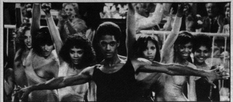
Energetic young hopefuls dance their way to fame in Fast Forward.