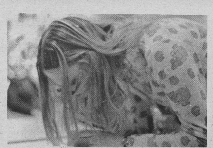
How fast can you drink beer from a straw?