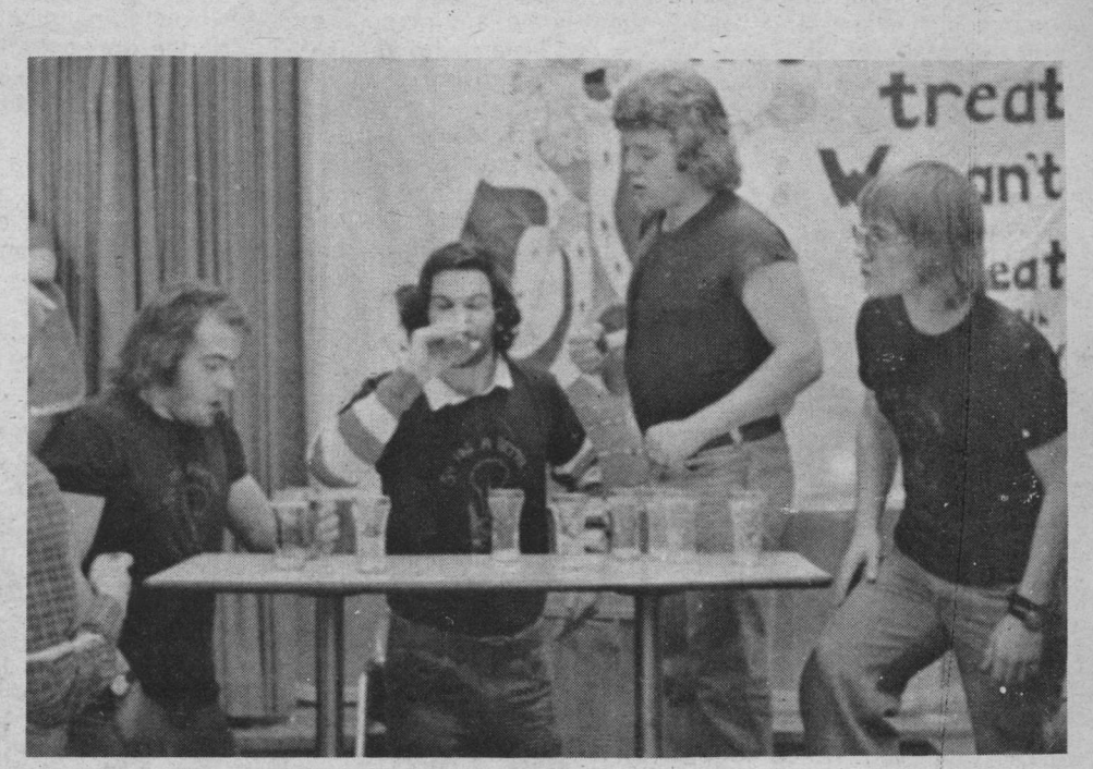
12 beer in 41 seconds