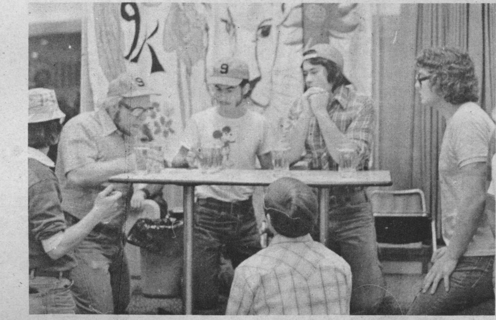
12 beer in 38 seconds