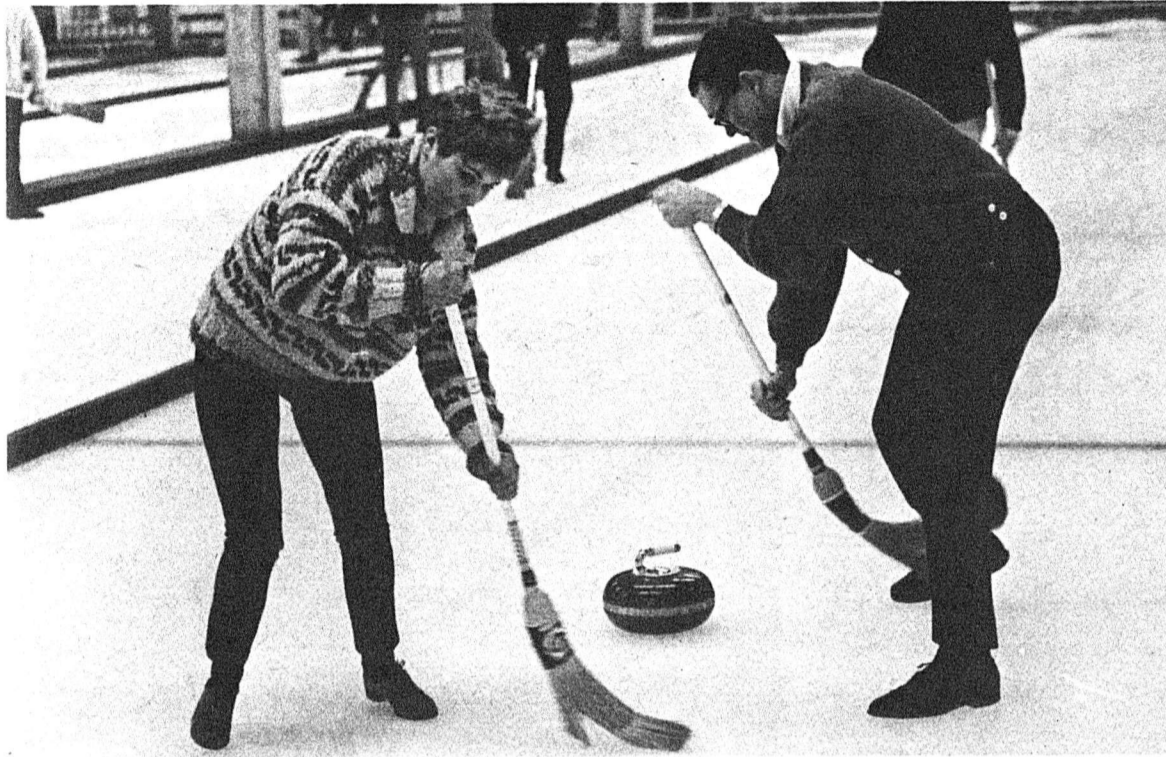
A WOMAN'S WORK IS NEVER DONE ... it's always sweep, sweep, sweep