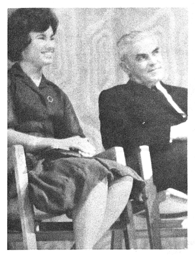
... AND SEEM TO APPROVE