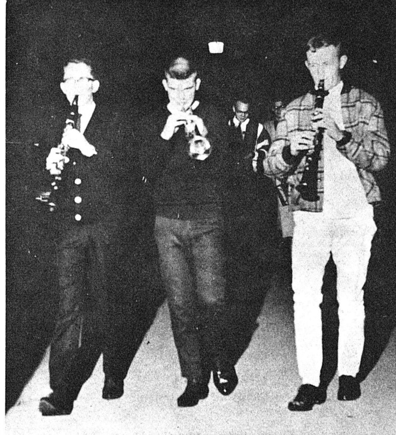
PIED PIPERS PARADE—Pembinites, ever young and ever "At one time, the Western nations impressionable, are led by rodent rousers to St. Steve's. turned to the Orient for the latest rat pack was given cocon and a change to most Stewitse. rat pack was given cocoa and a chance to meet Stevites.

He reached his conclusions, he sultation with the directors. said, after long historical study.