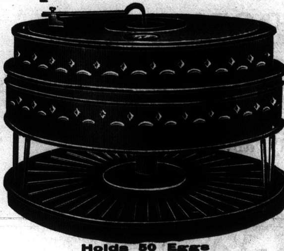
Holds 50 Eggs

A Twentieth Century wonder hatches every hatchable egg. Easily operated, fire-proof. Glass window so that Thermometer is in sight without touching machine.