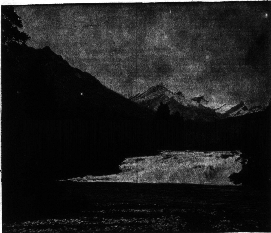
Bow Falls B.C.