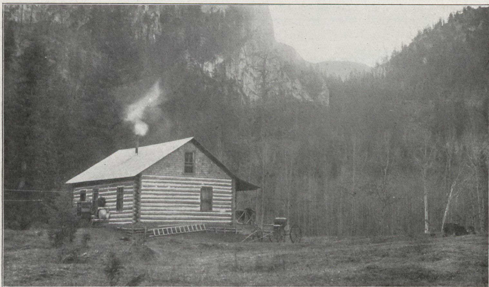
Amphitheatre ranger station, British Columbia.

schools have been established. In the United States, training has been supplied to some extent by special ranger schools, of which quite a number exist in connection with state and other universities, and also by the government itself through its ability to se-