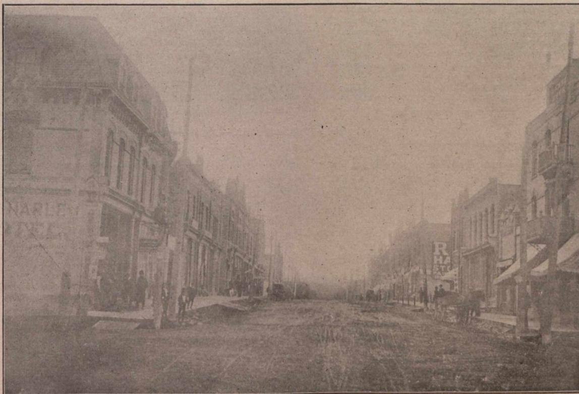
VIEW OF THE EAST END OF QUEEN STREET, PORT PERRY

Never in the history of building in Canada has so much been so rapidly done as at the Canadian National Exhibition in Toronto this year, where structures valued at upwards of $400,000 have been erected in less than five months. One of these, viz., the grand stand, is fairly entitled to be considered one of the "Wonders of the World" in building. This is a massive structure 725 feet long, 110 feet in width and 65 feet in height at its