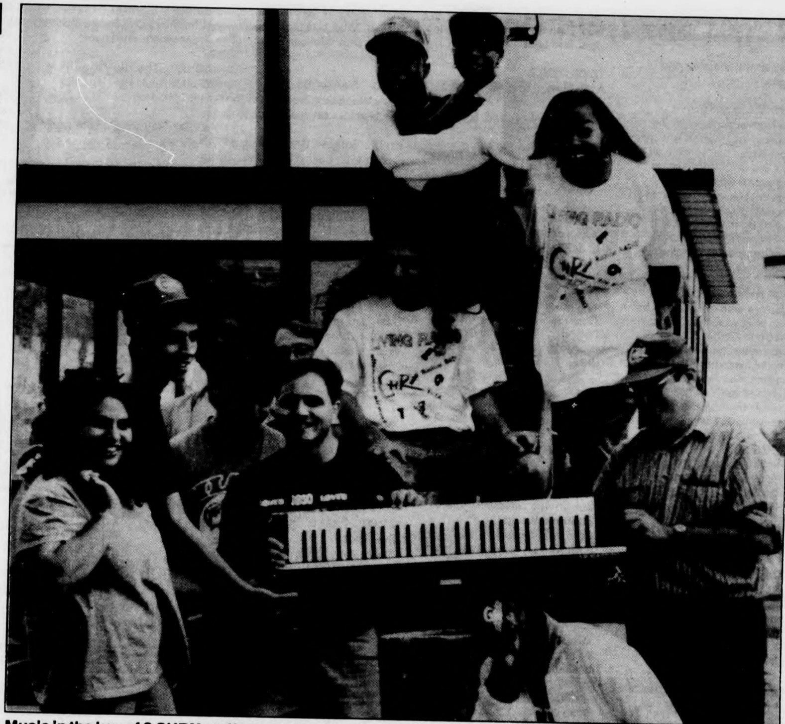
Music in the key of ? CHRY staff complete with keyboard. One of the few things not being given away during fundraising '92.

One of the things that makes community radio and CHRY in particular