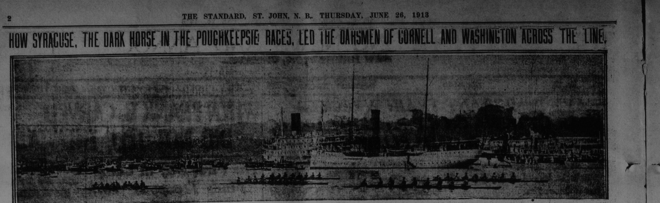
FINISH OF THE VARSITY EIGHT-SYRACUSE FIRST, CORNELL SECOND, WASHINGTON THIRD. ders in intercollegiate rowing race on the Hudson. Syracuse, the dark horse in this great aquatic event of the year, triumphed ove: Cornell, the favorite, in one of the most spirited contests in the his-coserve strength in the gruelling race, flashed across the line ahead of Cornell and Washington, thereby winning the stellar event of the regatta. The Cornell crew came in second, closely followed by