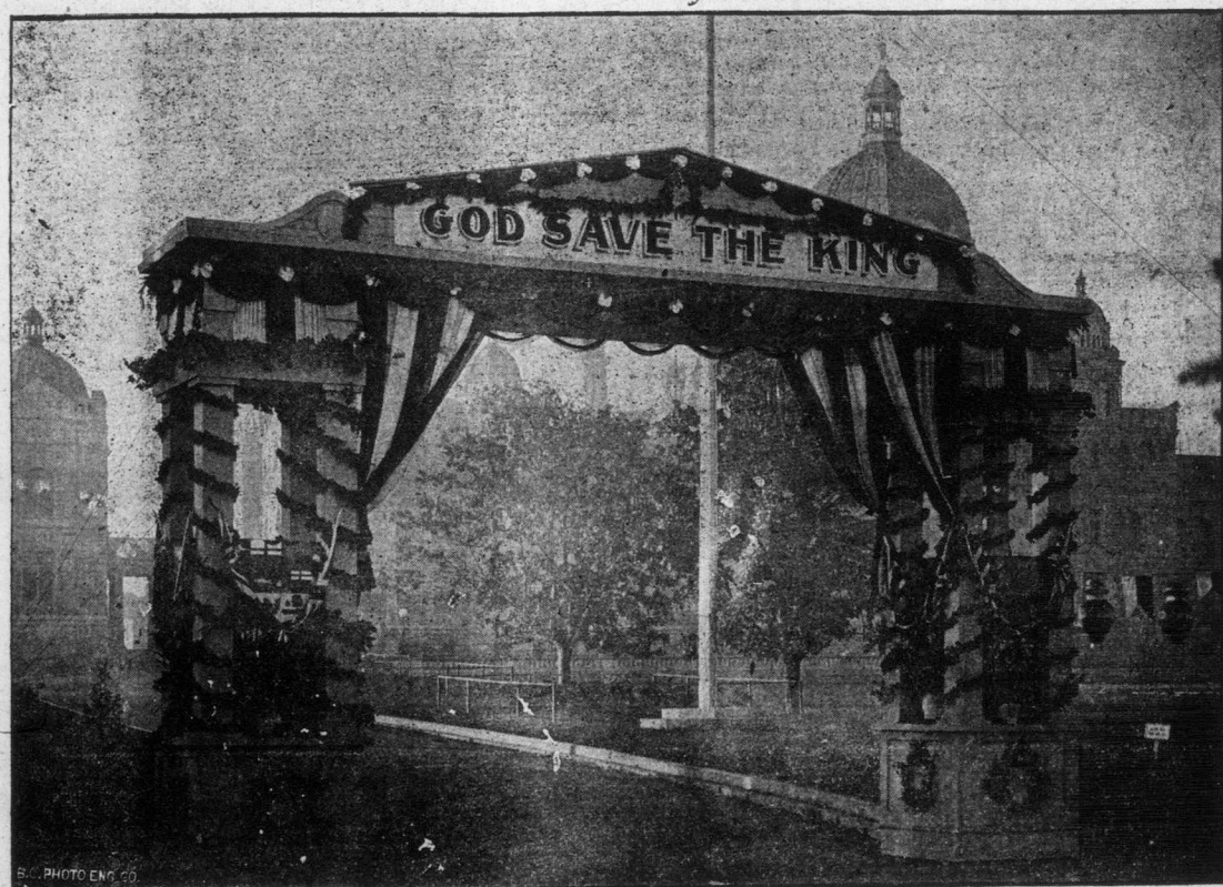
THE ROYAL VISIT—ARCH AT GOVERNMENT GROUNDS.

work of pacification has been dragged out and promised to go on interminably. The enemy were justified in hoping, as long as such tactics were allowed to continue, with men permitted to profess peace one moment and turn round and shoot the officers whose hospitality they had been enjoying the next, that the British would eventually become weary of the struggle and grant terms which would have left the Boers free to resume their ambitious schemes as soon as