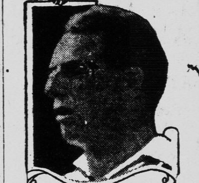
Beals C. Wright

When speaking of tennis players don't forget Beals Wright, one of the most sensational who ever wielded a racket. Wright has been requested to try for the Davis cup. He will make other cracks hum to keep him off.