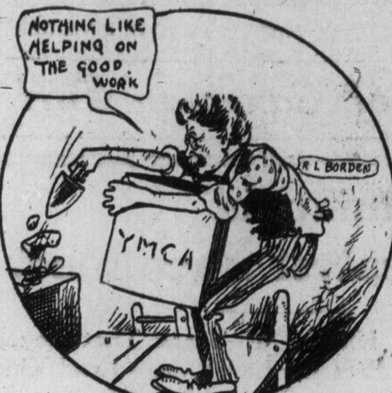
Premier Laying Y.M.C.A. Corner Stone