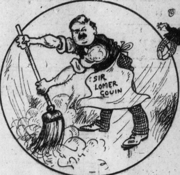
Govin Sweeps Quebec