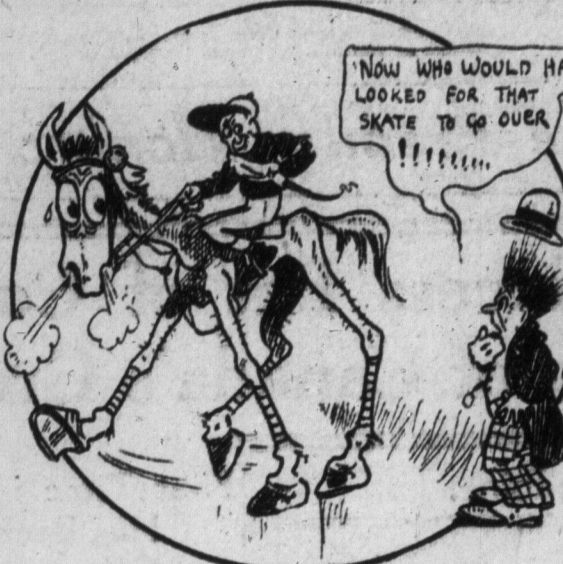
The Kings Plate (Woodbine)