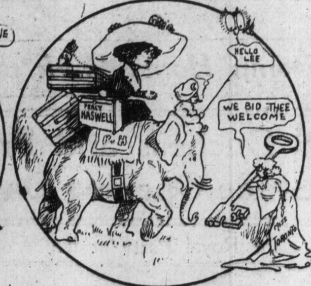
The Arrival of Toronto's Favorite Address