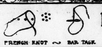
FRENCH KNOT ~ BAR TACK.

French knots are used in line decoration, and when nicely made are a very dainty way of trimming certain spaces in clothing, as those between groups of tucks. To make a French knot, bring the needle up on the right side of the cloth at the point where the knot is to be made, then holding the thread near the cloth with the left hand, wind it two or three times around the point of the needle, according to the thickness of the material, and then push the needle back into the cloth very near the place where it came