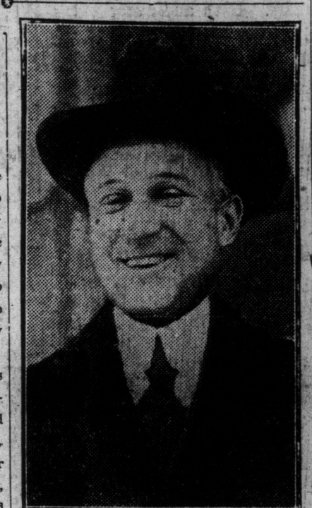
C. F. GRAY, Re-elected Mayor of Winnipeg by Majority of More Than 2,500.