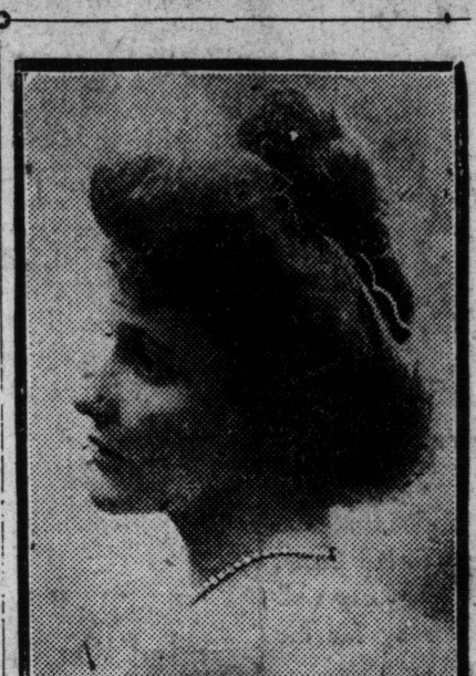
LADY ASTOR. Whose election for Plymouth seat British commons is announced.