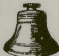
ST. GEORGE'S CHURCH MONTREAL, BELLS.

London Cathedral (Ont.), St. George's Church, Montreal, Ottawa Houses of Parliament, City Hall, Victoria, B.C., and thousands of others in all parts of the World.