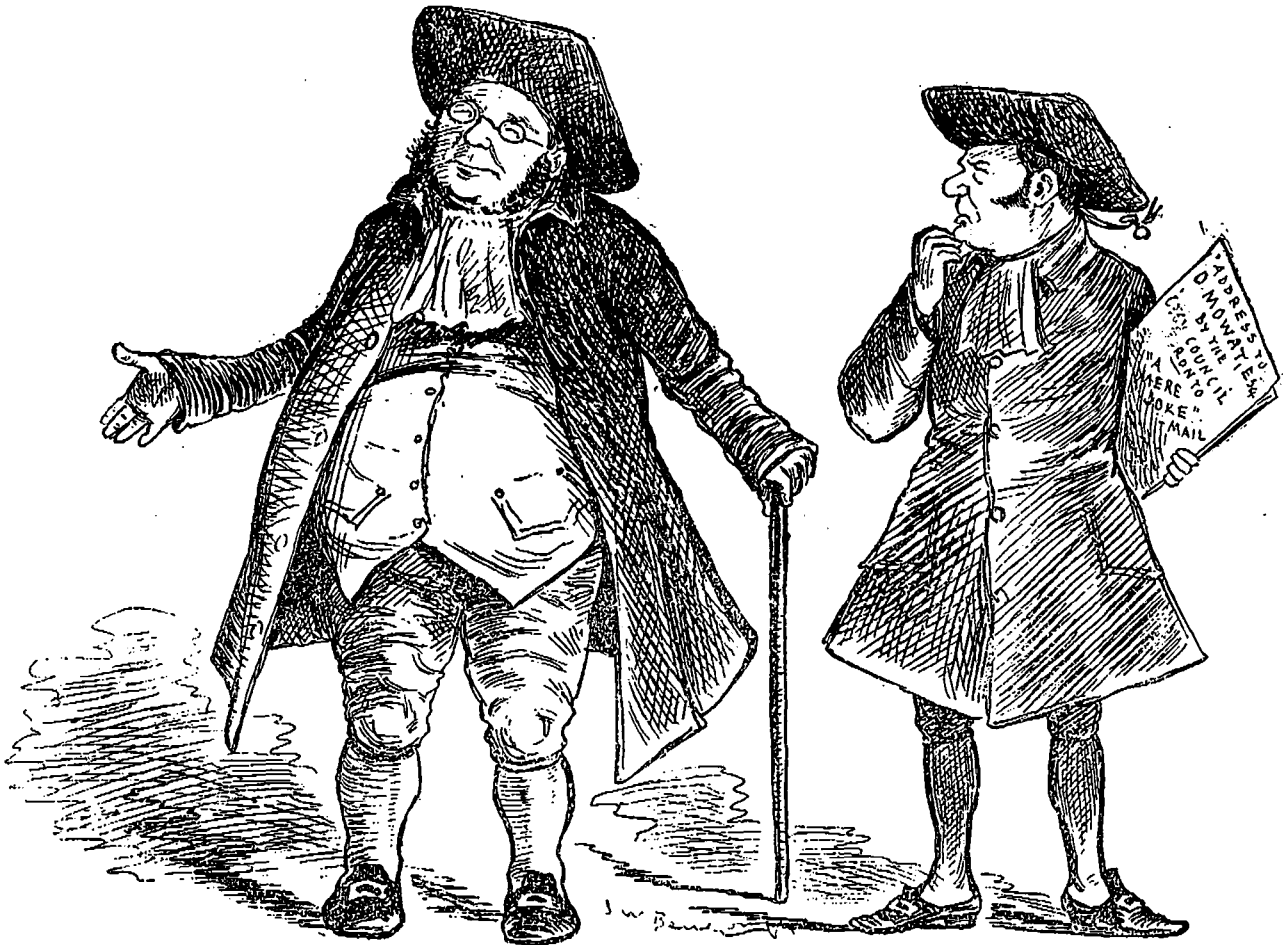
BOSWELL AND "JOHNSON."

BOSWELL.—How comes it to pass that we feel sensibly gratified by flattery, even when we are convinced that it is not sincere? "JOHNSON."—Because it shows us that we have so much power over the abjects who do flatter, as to force them to the meanness of telling a lie.— Vide Life of Dr. Johnson.