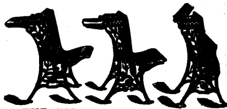
THE "MARVEL" SCHOOL DESK,

The Canadian Office and School Furniture Co., Limited, Successors to W. STAHLSCHMIDT & Co. Manufacturers of Office, School, Church and Lodge Furniture