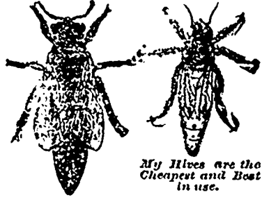
My Hives are the Cheapest and Best in use.

All those interested in Bees send for my 20 page circular and pamphlet on wintering bees (free)