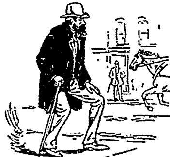
"Walked in a stooped position."