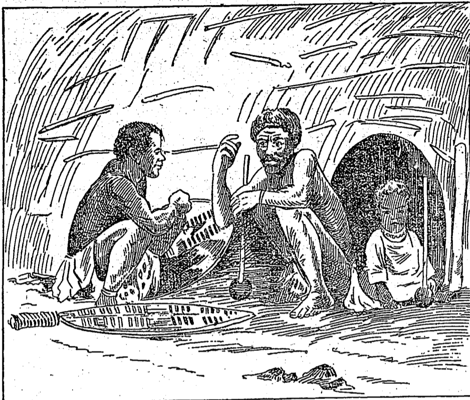
A ZULU KRAAL.

Proceeding still further on our journey, we encamped at night so near the coast that we were kept awake a long time by the ocean's roar, and having spanned out near some trees, I was full of fear lest a mamba (snake) should take a fancy to swallow me