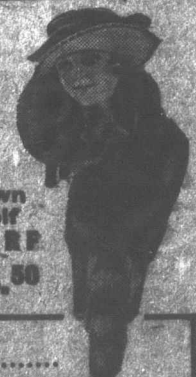
Brown Wolf Scarf $28.50

Hangs gracefully from the shoulders, has deep, shaggy collar, deep cuffs, full belt, reverses double border at feet on the skirt, shaggy pockets. Fancy silk lined. Skirt sweeps 74-76 inches, a garment of high class finish and appearance at a very low price.