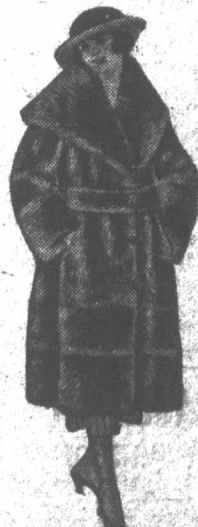
Mink Marmot Coat $89.50

Hallam's Book of Fur Fashion, Edition 1922, containing about 250 illustrations of beautiful Fur Garments, all high quality, and selected styles as worn in London, New York, Paris, Toronto, and other centers, has now become the recognized standard family guide. There is no other book printed, and very few stores, that can show you such a large and varied selection of Fur Coats, Scarves, Stuffs, etc. It illustrates Fur to suit every member of the family, every taste, every purse. Send a post-card for your copy to-day. It's FREE.