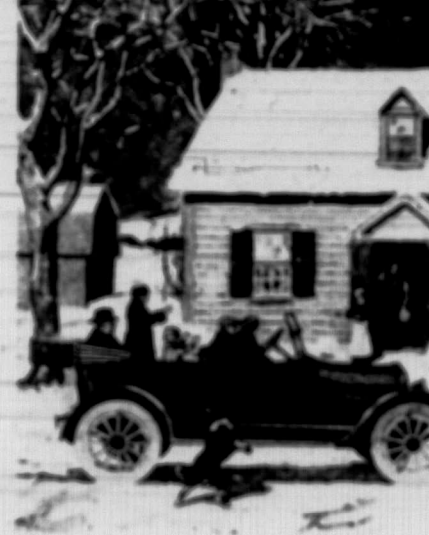
McLaughlin 5-passenger Touring Car. E-4-35

Send for the new 1918 Catalogue of Series "E" giving description and prices.