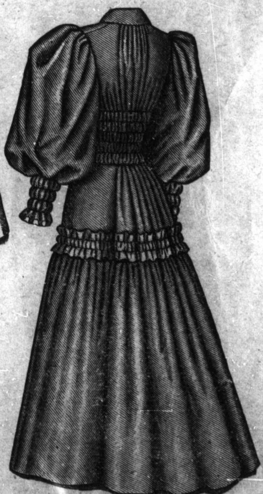
FIGURE No. 274 G.—LADIES' VISITING TOILETTE. FIGURE No. 274 G.—This consists of Ladies' skirt No. 6677 (copyr't), seen again on page 7; and round basque-waist No. 6696 (copyr't), on page 7. The skirt pattern is in 9 sizes for ladies from 20 to 36 inches, waist measure, and costs 30 cts. The waist pattern is in 13 sizes for ladies from 28 to 46 inches, bust measure, and costs 25 cts. To make the toilette for a lady of medium size, will require 14 1/4 yards of material 22 inches wide; the skirt calling for 9 1/4 yards, and the waist, for 5 yards. Of 44-inch-wide goods, they need 8 1/2 yards.

LADIES' DRESS, WITH SKIRT HAVING A GORED UPPER PART AND A GATHERED LOWER PORTION. (COPYRIGHT.) No. 6694.—This dress will make up attractively in all sorts of soft, clinging fabrics, and lace, insertion, etc., will form pleasing garnitures. The pattern is in 11 sizes for ladies from 28 to 42 inches, bust measure. For a lady of medium size, it needs 11 1/2 yards of goods 22 inches wide, or 6 1/4 yards 44 inches wide, or 5 3/4 yards 50 inches wide. Price of pattern, 30 cents.