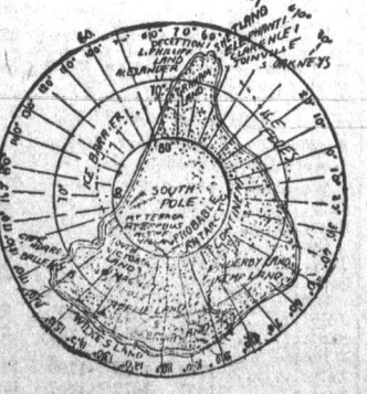
MAP OF THE ANTARCTIC CONTINENT. has already been so fruitful of re- sults, is but little over thirty and looks still younger. He is about 5 feet 6 inches height, with blue eyes and brown hair.

Captain R. F. Scott, who com- mands the expedition and who will remain another year in the Antarctic regions to continue the work which