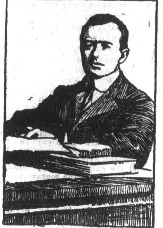
CAPTAIN R. F. SCOTT. 100 miles still farther south, reach- ing latitude 82.17, which establishes a record, being four degrees higher than has heretofore been accomplish- ed.

The relief party found the Discov- ery on Jan. 23 in MacMurdo Bay, Victoria Land. The expedition win- tered 400 miles farther south than any vessel had previously done, and Captain Scott, with Dr. Wilson and Lieutenant Shackleton, penetrated